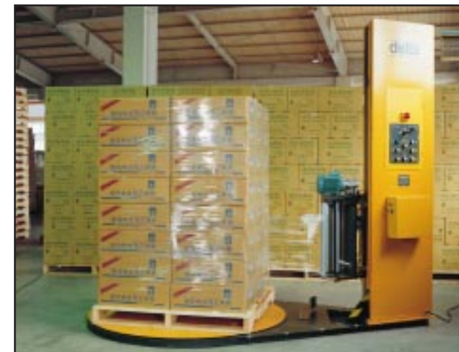
1. For pallet packing Items: Food cans, chemical products, electronic components, cement, construction materials, casing products, synthetic rubber, PVC asbestos tiles, enameled tiles, screws, cereals, or products using collective pallet packing for transporting.