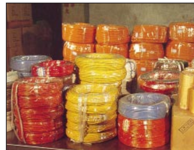
3. For packing small individual articles Items: Electric wires, iron wires, steel wires, PVC hoses, wheels, spare parts, sculptures, toilet soaps, shoes and other small articles.